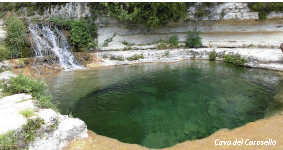
Cava del Carosello

Depart: NAS I ITT 8:30 am Return: 4:00 pm Ages: Minimum age 12 years, children 17 and under must be accompanied by an adult. Cost: $25 (transportation ONLY); $35 (transportation and rental package) Liberty: $15/$25 Experience the ride of a lifetime shredding Mt. Etna's snow covered slopes. Outdoor Recreation offers rental packages that include: snowboard, boots, bindings and helmet. Note: All reservations for rental gear must be made 1 day prior to the trip on a first-come, first-serve basis. Not a snow person? Enjoy a day of beautiful winter scenery, shopping and lunch. LIFT TICKETS are NOT included; bring €35-45 for lift ticket and food. Trip is subject to proper snow and weather conditions.